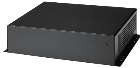
▲ Front view