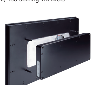
▲ Modulized design