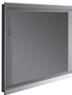
▲ Ultra-slim mechanism design